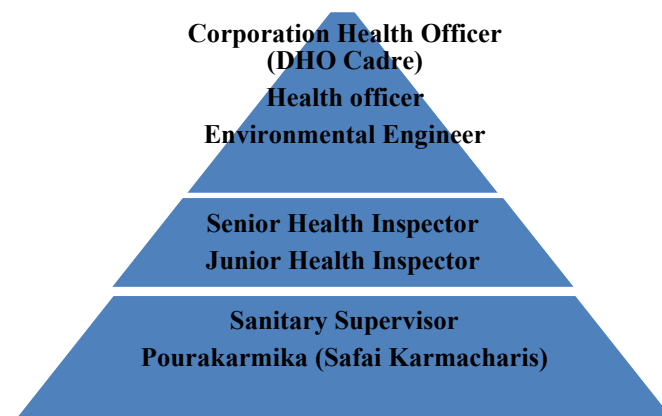
Chart 1: shows the structure of Health section in Mysuru City Corporation

The Health Section of the Mysuru City Corporation plays a central role in the effective management of municipal solid waste in Mysuru City. The organizational framework of the Health Section is depicted in the chart below.