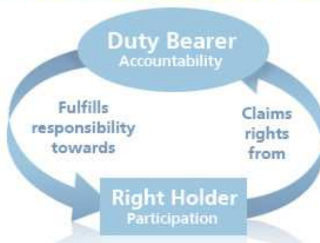
Figure 2 : The reciprocal relationship between rights holders and duty bearers

Basic needs include access to education, health services, food, housing, employment, and the fair distribution of income. Social development promotes democracy to bring about the participation of the public in determining policy, as well as creating an environment for accountable governance. Social development works to empower the poor to expand their use of available resources in order to meet their own needs, and change their own lives. Special attention is paid to ensure equitable treatment of women, children, people of indigenous cultures, people with disabilities, and all members of populations considered most vulnerable to the conditions of poverty.