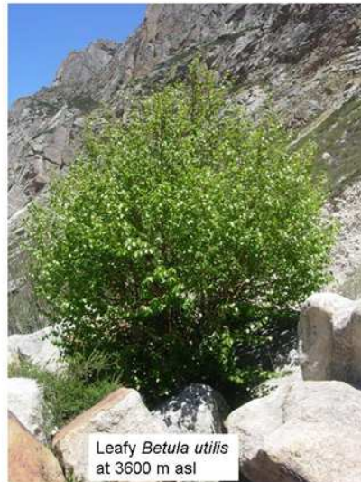
Figure 3: Leafy Betula utilis at 3600m asl