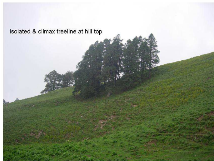
Figure 2: Isolated and climax tree line at the hill top