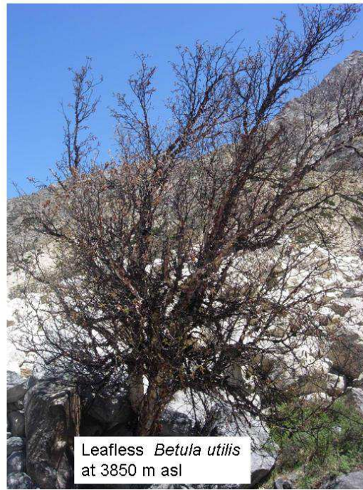
Figure 5: Leafy Betula utilis at 3850m asl

The Chorabari Glacier Valley represents south facing aspect and drains its water to the Alaknanda River and its specific alpine treeline area located between the latitude 30^{\circ} 39'30''\text{N} and 30^{\circ} 45'10''\text{N} , and longitude 79^{\circ} 01'30''\text{E} and 79^{\circ}52'0''\text{E} in the proximity of glacier snout was considered for study. While Dhokriani glacier Valley is oriented towards the north face and is a part of Bhagirathi River catchment. Its precise alpine treeline area located between the latitude 30^{\circ} 50'16''\text{N} and 30^{\circ} 53'18''\text{N} , and longitude 78^{\circ} 45'20''\text{E} and 78^{\circ}48'20''\text{E} was studied in detail with respect to glacier snout along with the vicinity area (Figure 1).