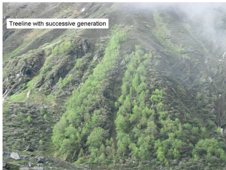
Figure 4: Tree line with successive generation