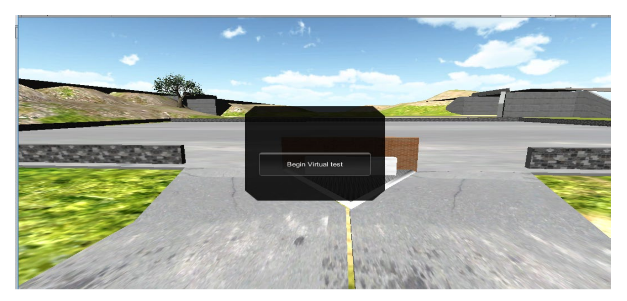
Figure 1. Interface of a driving license system

We recall that a driving simulator can be considered akin to a vehicle operated in such a way that enables the production of sensory stimuli which could be visual, auditory, and/or haptic, so as to generate a seemingly virtual environment (VE) equivalent. This VE environment therefore is desirable as it can be acted upon by the driver on both a cognitive as well as at perceptive level (Milleville-Pennel and Charron, 2015). In this study the researcher proposed a driving simulator, which the researcher modelled on a computer. The aim was to create a simulation system. The figure 1 below shows the interface of the virtual yard test (the model used in this study).