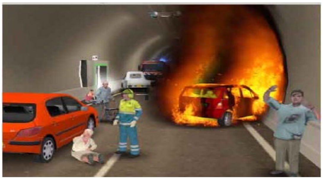
Figure 2. Possible VR scenario adapted from (Anon, 2016)

mental immersion exists in those systems (low level systems such as desktop VR system) but "with a lower level than enhanced systems. Muhanna (2015) also believes that a system that does not provide any level of mental immersion should not be considered a virtual reality system in the first place". Figure 2 below presents typical scenarios in which virtual reality is commonly relevant.