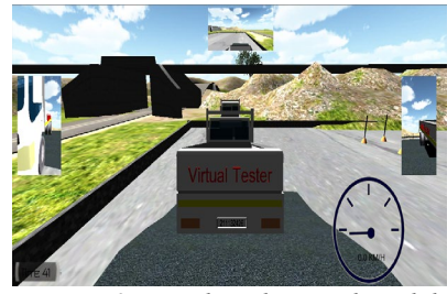
Figure 3. Developed Virtual model