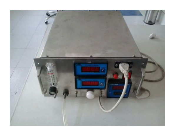
Figure 1: The entire generator cum processor