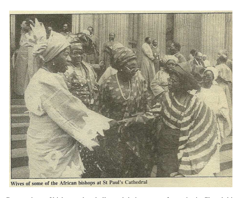
Figure 4: Brave wives of bishops who challenged their spouses for parity in Church hierarchy.

In the background are the bishops. In front are their rebellious wives demanding for parity in Church-hierarchy.