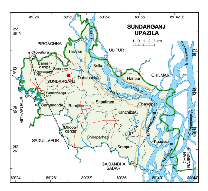
Map 2: Location of Haripur union in Sundarganj upazila

alternative to accepting the 'new' for development. The others' concern is such that in spite of their aims for 'development', there are many reported incidents that show how different NGO interventions turn out to be 'development disasters'. In this context, the present study used a 'Sustainable Livelihoods Approach' as the analytical framework as it offers an opportunity to reveal an all round view of the circumstances of the poor.