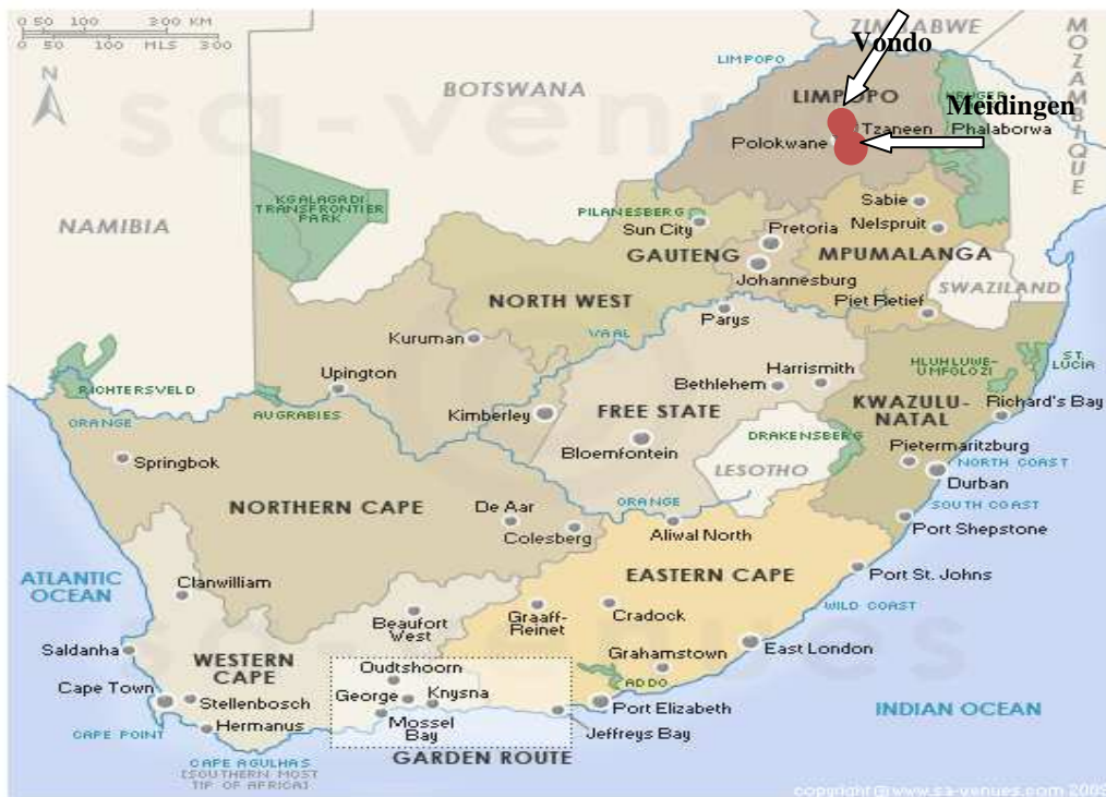
Figure 1: Location of Vondo and Meidingen Villages in South Africa

These two villages are identified in the Map (Figure 1)