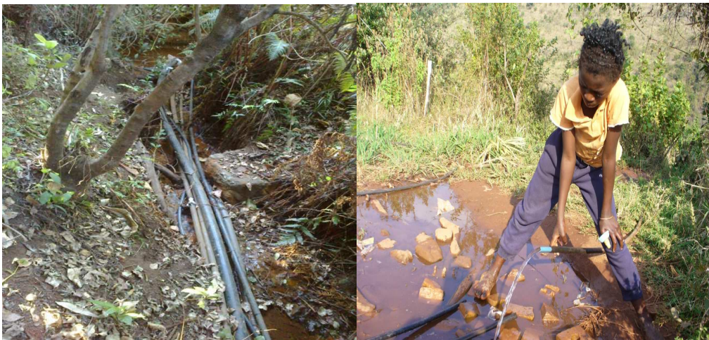
Figure 2: Pipes connected at the spring sources (left) and water being collected from a pipe (right)

A total of six springs were identified in Vondo. On average it was found that each spring was serving more than 20 households on a daily basis. Whilst there are taps in the community, households collect water from springs on a daily basis. Communities in this area connect pipes at the spring source to allow the water to gravitate into their households or communal collection points for those who cannot afford to install their own pipes (See Figure 2. About 90% of the households interviewed thought springs were the most reliable and important source of water in the community. The flow measurement from the identified springs were recorded (during spring season), and recorded between 0.1L/s to 0.5L/s. These measurements indicate that the potential water storage in 24hrs from all the springs in Vondo would be approximately 40 m 3 . This amount of water can supply a population of 1400 people (about 220 households) at RDP level (i.e. 25l/p.d -1 ). These figures indicate that there is room for springs in water service planning.