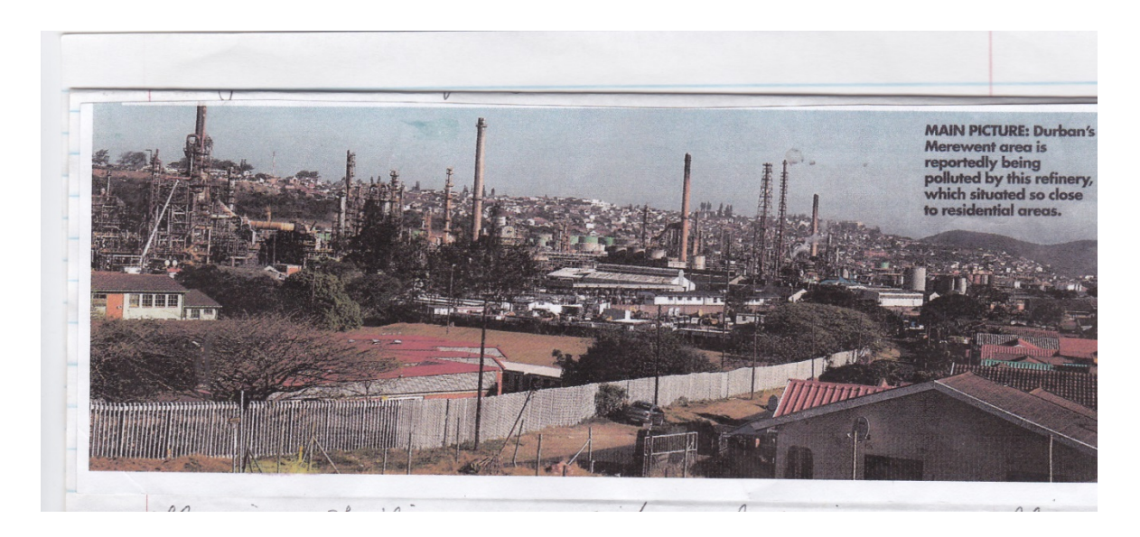
Figure 1: A refinery situated close to residential areas